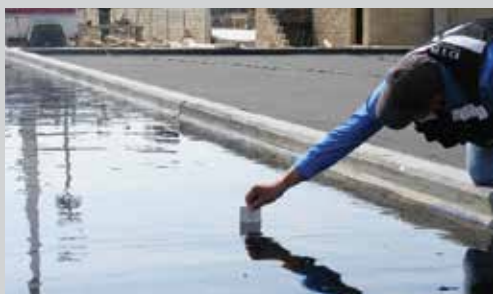
Application of full thickness in a single coat