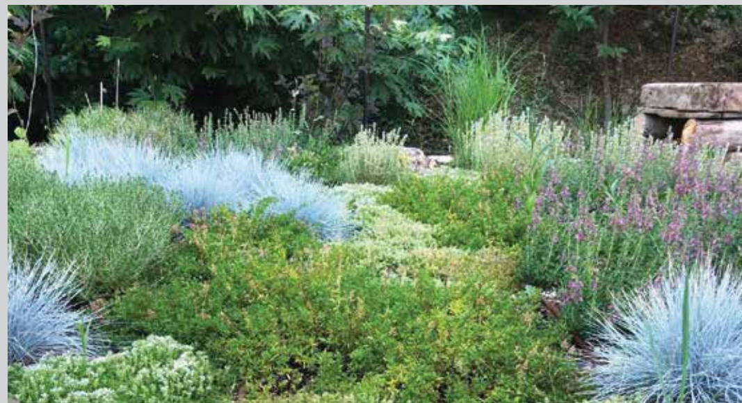
Anti-root resistance properties for landscape use