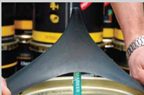
Elongation over 2000%